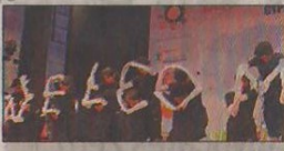
Apart from seven fests, the college will also host a Battle of Bands on January 30