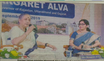
Former Union minister Margaret Alva speaks at a programme held in St Aloysius College in Mangaluru on Wednesday.