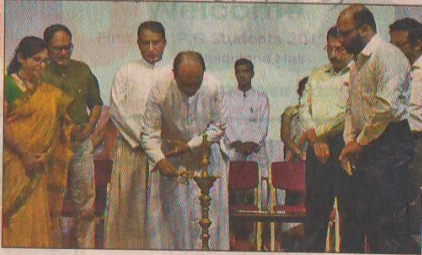
ಓರಿಯಂಟೇಶನ್ ಕಾರ್ಯಕ್ರಮದ ಉದ್ಘಾಟನೆಯನ್ನು ಗಣ್ಯರು ನೆರವೇರಿಸಿದರು.