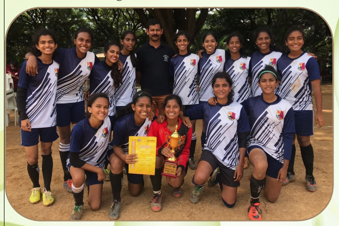
Semi final was played against MCC. Score 5-0 In finals college played against Host Christ (Deemed to be University). Score 2-1 in penalty.

Football players of St Aloysius College Mangalore, are the champions of Chri-Spo-Fest in Football tournament organized by Christ (Deemed to be University) Bangalore on 28 & 29 August 2018.