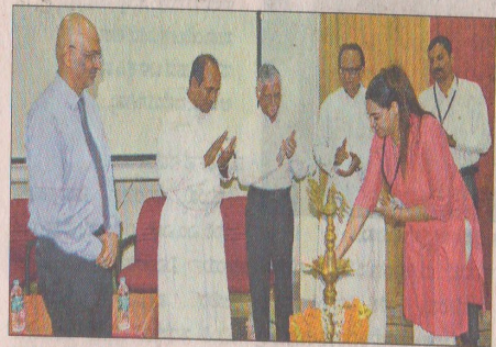
ಕಾರ್ಯಕ್ರಮವನ್ನು ದೀಪ ಬೆಳಗಿಸಿ ಉದ್ಘಾಟಿಸಲಾಯಿತು. 24.11.2017